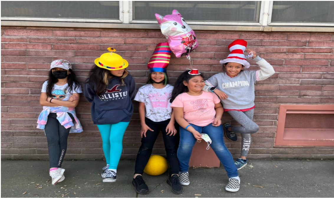
Big Hat Day! 4th Grade Student